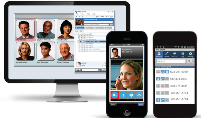
Summit UCS Desktop & Mobile Clients