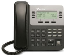
Edge 9000 Series IP Phones

Get the most out of the Summit's feature set with Vertical's new Edge 9000 Series IP and digital phones and DECT phones featuring display-based interfaces, call logs, self-labeling keys and simplified administration. The optional Summit Wireless DECT System let's you cost-effectively increase your coverage, voice traffic and number of users with up to 48 additional extensions. The Summit also integrates with other Vertical SBX IP and MBX IP digital, SIP and IP phones, as well as Vodavi single-line analog, XTS, STS and Triad phones to protect and extend your current communications capabilities and investment.