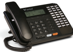
Edge 9000 Series Digital Phones