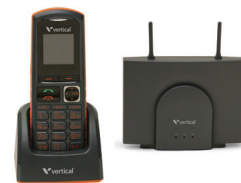
Summit Wireless DECT System

For more information on the Vertical Summit, visit www.vertical.com , call 1-877-VERTICAL, or contact an authorized Vertical Summit dealer.