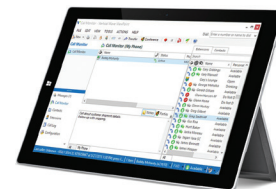
The award-winning ViewPoint user interface is easily customized to personalize every customer interaction.

The Vertical Wave IP™ Communications System replaces the traditional business phone system with a powerful appliance and package of embedded applications in an all-inclusive platform to streamline enterprise communications. The Wave IP Platform provides voice, mobile and collaboration solutions for improving critical business workflows and facilitating the way we work in today's Modern Enterprise.