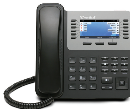
Edge 9840 Color Screen IP Phone

Take full advantage of the Wave IP's advanced technology with feature-rich, high-quality audio phones for desktop and remote workstations from Vertical. Featuring the latest in VoIP technology, Vertical's newest and most advanced family of phones – the Edge 9800 IP Series – supports hundreds of enterprise-level phone features, including call recording, conferencing, paging and hot desking. The Wave IP is also compatible with Vertical digital and DECT phones, as well as popular third-party handsets, including Polycom's VVX Series and SoundStation conference phones, and rugged Spectralink wireless solutions designed specifically for use in demanding enterprise environments such as retail and health care.